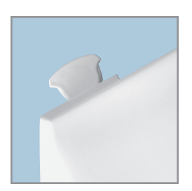
PLASTIC EASY•CLEAN & CHANGE® HINGES