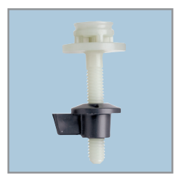
NON-CORROSIVE BOLTS AND WING NUTS