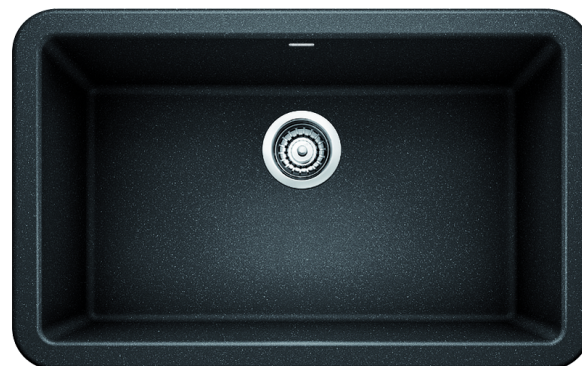
Model 401732 shown