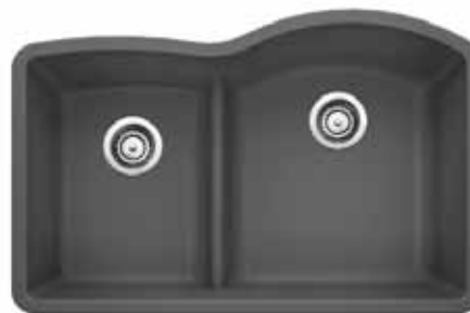
Model 441600 shown

While BLANCO endeavors to provide accurate information, all dimensions are nominal, cannot be guaranteed, and are subject to change or cancellation. BLANCO assumes no responsibility for use of superseded or voided specifications.