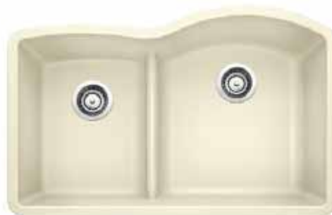
Model 441606 shown

While BLANCO endeavors to provide accurate information, all dimensions are nominal, cannot be guaranteed, and are subject to change or cancellation. BLANCO assumes no responsibility for use of superseded or voided specifications.