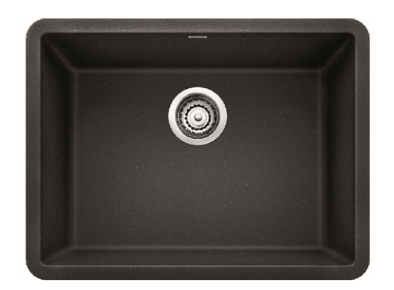
Model 522258 shown