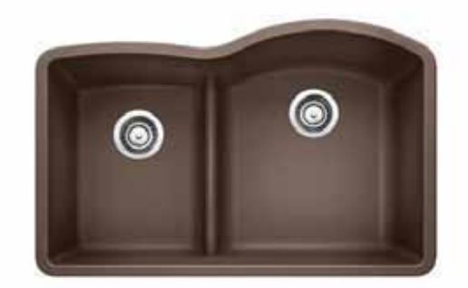
Model 441609 shown

While BLANCO endeavors to provide accurate information, all dimensions are nominal, cannot be guaranteed, and are subject to change or cancellation. BLANCO assumes no responsibility for use of superseded or voided specifications.